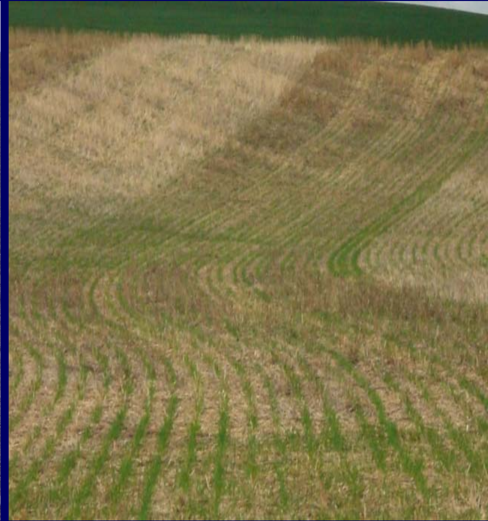
After (cross slot direct seeding)