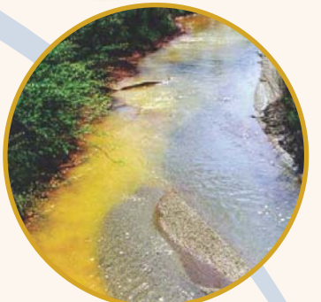
Acid mine drainage has left a toxic legacy in this stream in the Tar Creek area of Oklahoma.

After a series of shortterm fee extensions, on December 9, 2006, the 109th Congress passed the Surface Mining Control and Reclamation Act Amendments as part of the Tax Relief and Health Care Act of 2006. The legislation reauthorizes the collection of the coal severance tax for 15 years and directs more money to states with the greatest number of abandoned mine land problems. The legislation also allows states to set aside up to 30 percent of their grant money for abatement of acid mine drainage problems. The 109th Congress is to be commended for its decisive action in addressing this significant issue.