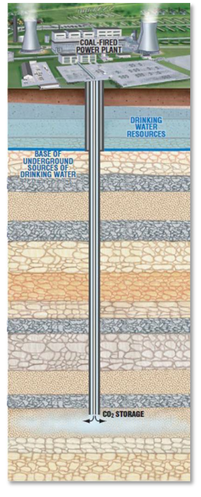
Class VI well schematic.